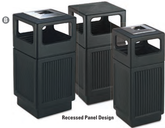
Recessed Panel Design