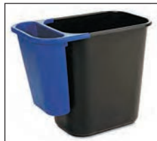
Wastebasket sold separately