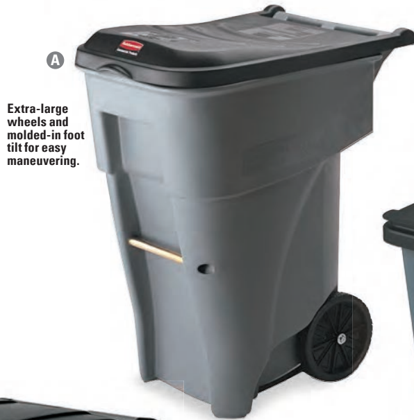
A Extra-large wheels and molded-in foot tilt for easy maneuvering.