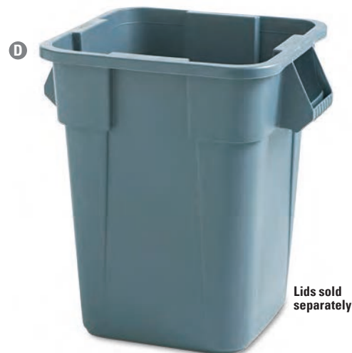
Lids sold separately