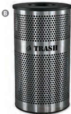
Matching recycling receptacle also available.

A Kaleidoscope Collection™ Recycling Receptacle Modular trash and recycling receptacles feature rigid plastic liners and fire-safe steel exteriors. Fingerprint-proof removable steel lid and powder-coated body finish. Lid opening designed to fit one of several designated waste products. Four rubber feet raise receptacle to protect floor surface and restrict the growth of mildew and mold. Manufacturer's limited one-year warranty.