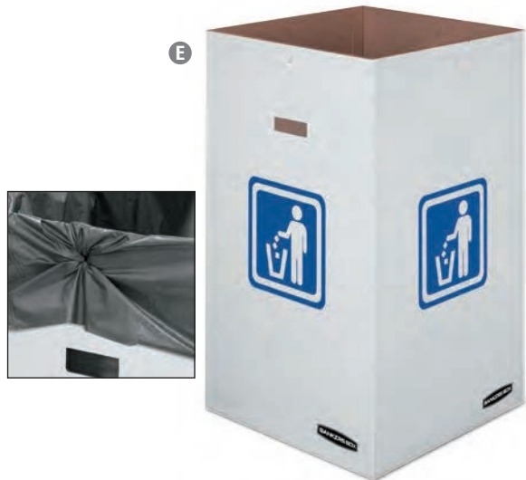
An economic way to set up temporary recycling center. Liners not included.